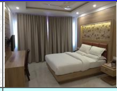
Hotel Photos for Super Deluxe Luxurious Tour (Hotel Tariff Approx Rs. 5000/- To 6000/- Per Day / Per Room With Breakfast)